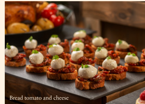
Bread tomato and cheese